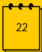
Equal Pay Day

"Teachers must work harder to inspire young girls to study STEM subjects."