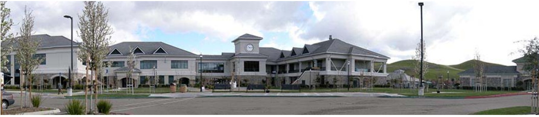
Diablo Valley College San Ramon campus.

Nippy weather, but the sun did shine and the girls were enthusiastic. Almost 300 sixth through ninth graders attended the Math & Science Conference at the new Diablo Valley College campus in San Ramon. A dozen workshops covered such diverse topics as dentistry, PC repair, and optics. The Career Fair exhibitors included women from the Oakland Zoo, Behring Auto Museum, veterinary and health care sciences, law enforcement, hazardous materials, archaeology and computer tech fields. Be sure to check out the photos of EYH on our web site at http://www.aauw-da.org .