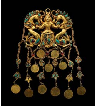
Afghanistan: Hidden Treasures from the National Museum, Kabul

The next AAUW Art & Garden outing is to the Asian Art Museum on Friday, November 21, 2008, to see "Afghanistan: Hidden Treasures from the National Museum, Kabul." In 1978, on windswept plains of northern Afghanistan, archeologists unearthed tombs of ancient nomads that had been sealed for two thousand years and discovered an extraordinary trove: some 22,000 individual pieces of gold buried with the remains of six Bactrian Central Asian nomads. Within months of this discovery, the country descended into war, and the so-called Bactrian Hoard disappeared into legend once more. Twenty-five years later, in 2003, Afghanistan surprised the world by announcing that the priceless artifacts had been located intact in the presidential palace bank vault in Kabul. They had been rescued, along with other masterpieces of the National Museum, Kabul, and protected in the intervening years of turmoil by a group of selfless Afghan heroes who have come to be known as "the key holders".